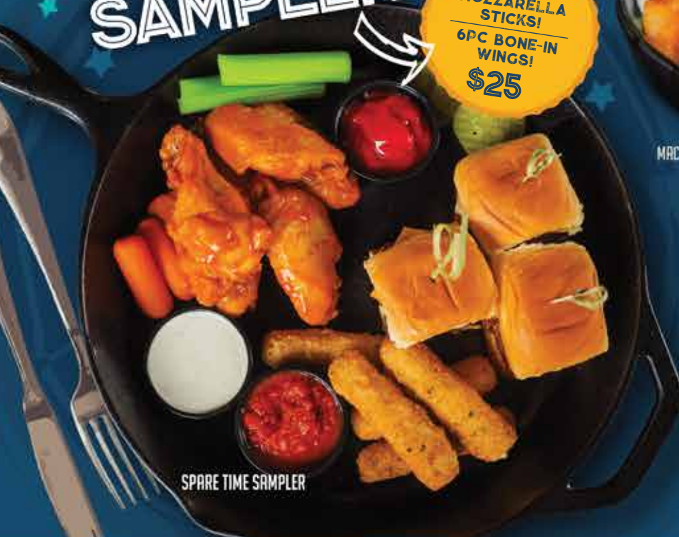
SPARE TIME SAMPLER

BEEF SLIDERS! MOZZARELLA STICKS! 6PC BONE-IN WINGS! $25