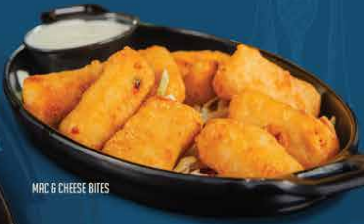
MAC & CHEESE BITES