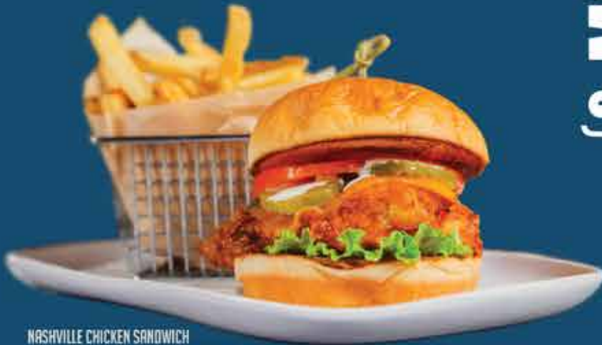
NASHVILLE CHICKEN SANDWICH

KING'S HAWAIIAN SWEET ROLL / BEEF PATTY / AMERICAN / LETTUCE / TOMATO / RED ONION - $14 DOUBLE BURGER - $18