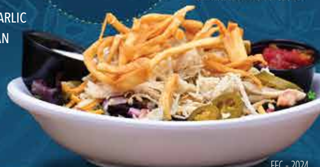
SOUTHWEST CHICKEN SALAD