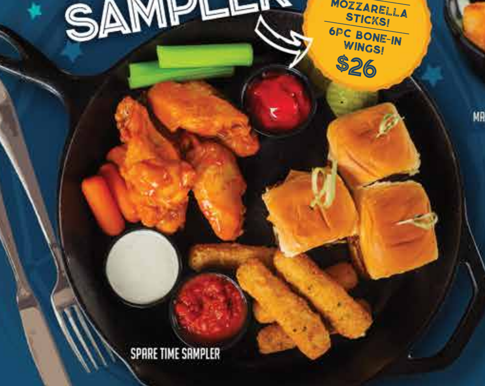
SPARE TIME SAMPLER

BEEF SLIDERS! MOZZARELLA STICKS! 6PC BONE-IN WINGS! $26