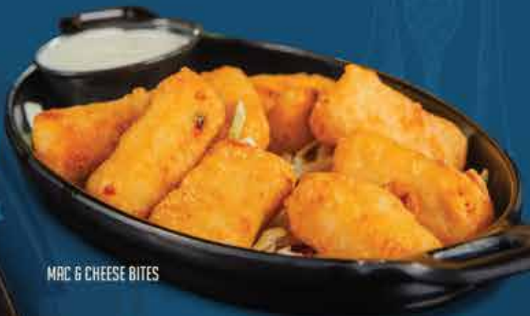
MAC & CHEESE BITES