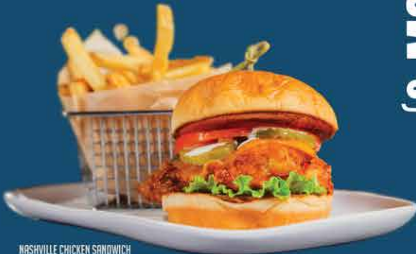
NASHVILLE CHICKEN SANDWICH

KING'S HAWAIIAN SWEET ROLL / BEEF PATTY / AMERICAN / LETTUCE / TOMATO / RED ONION - $14 DOUBLE BURGER - $18